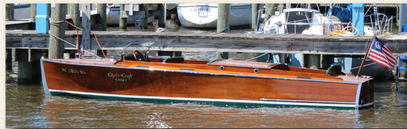
Pouf 1929 Chris Craft Cadet Pure Romance On the Water