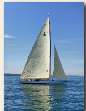
Bernida 1921 Champion R-Class Racing Boat