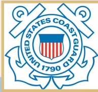
United States Coast Guard MLB 36460 1941 36' Motor Life Boat