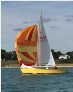
Flashback 1956 Nickels and Holman 19' Lightning Class One Design Racing Sloop