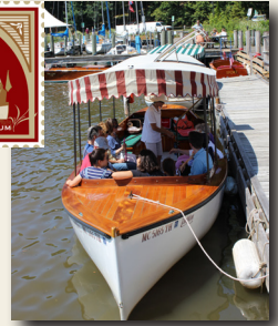
Lindy Lou Replica Turn-of-the-Century River Launch