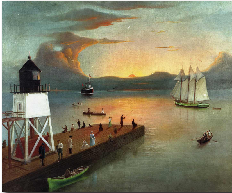
"South Haven Pier" 1895-1900.