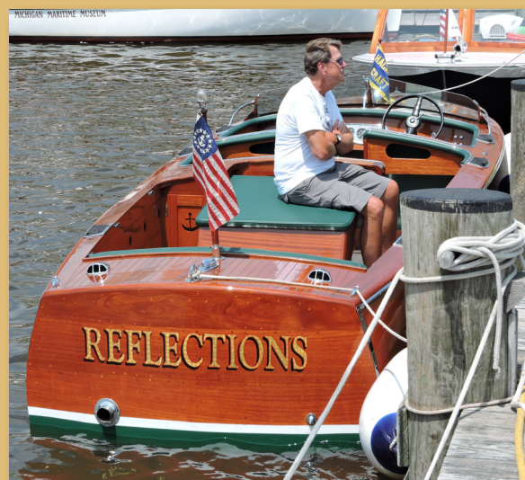
Right: Stunning boats of all types graced this years 36th Annual Antique & Classic Boat Show at the MMM. Despite the deary weather, our participants and visitors weren't daunted and the boats looked spectacular at our docks and on our campus.