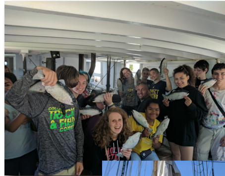
Left: Coloma 8th Graders aboard Evelyn S. learning about the historic commercial fishing industry.

The Museum is honored to be tasked with preserving our maritime heritage and passing on that sense of pride to the next generation of historians and scientists.