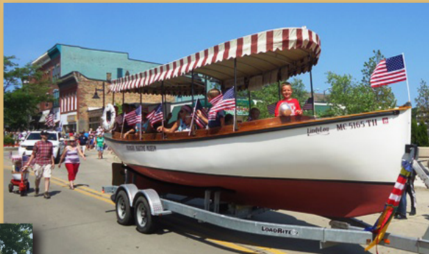
Left: The MMM showcased our river cruiser Lindy Lou in the South Haven 4th of July parade this year. What a wonderful star-spangled way celebrate the holiday and show off a cool boat!