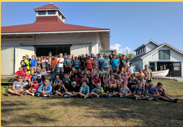
2017 Quincy Elementary 5th Grade Visit