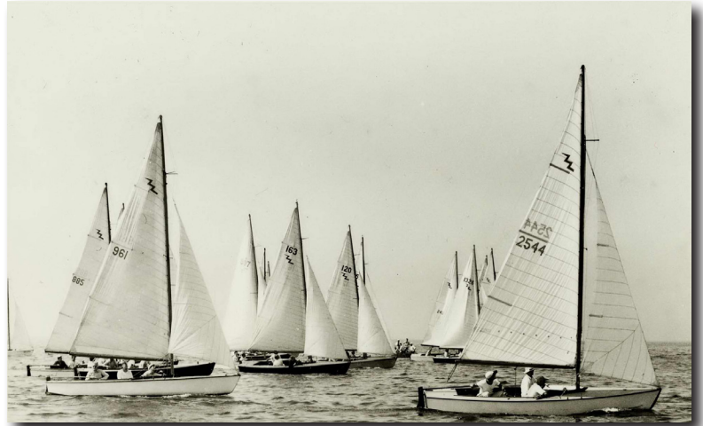
South Haven Lightning Class sailboats circa 1940.

Flashback actually raced in the Lightning 40th Year Anniversary Regatta, held on Lake Skaneateles, in 1978, taking second place in the Wood Boat Division, behind Zig Zag (which while a wooden hull, sailed with a modern aluminum rig). Olin Stephens