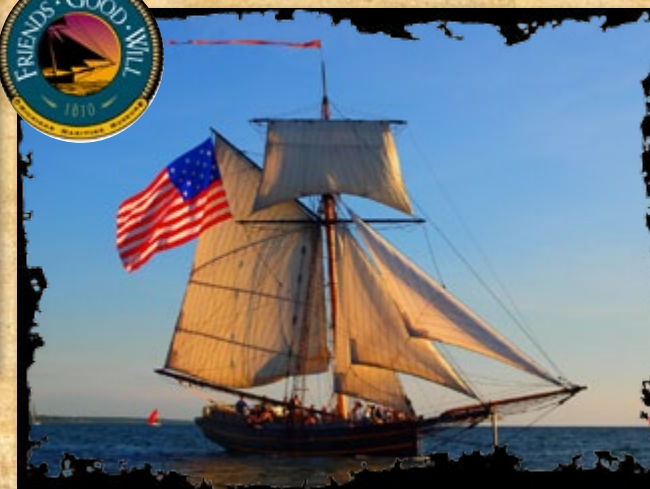
Friends Good Will