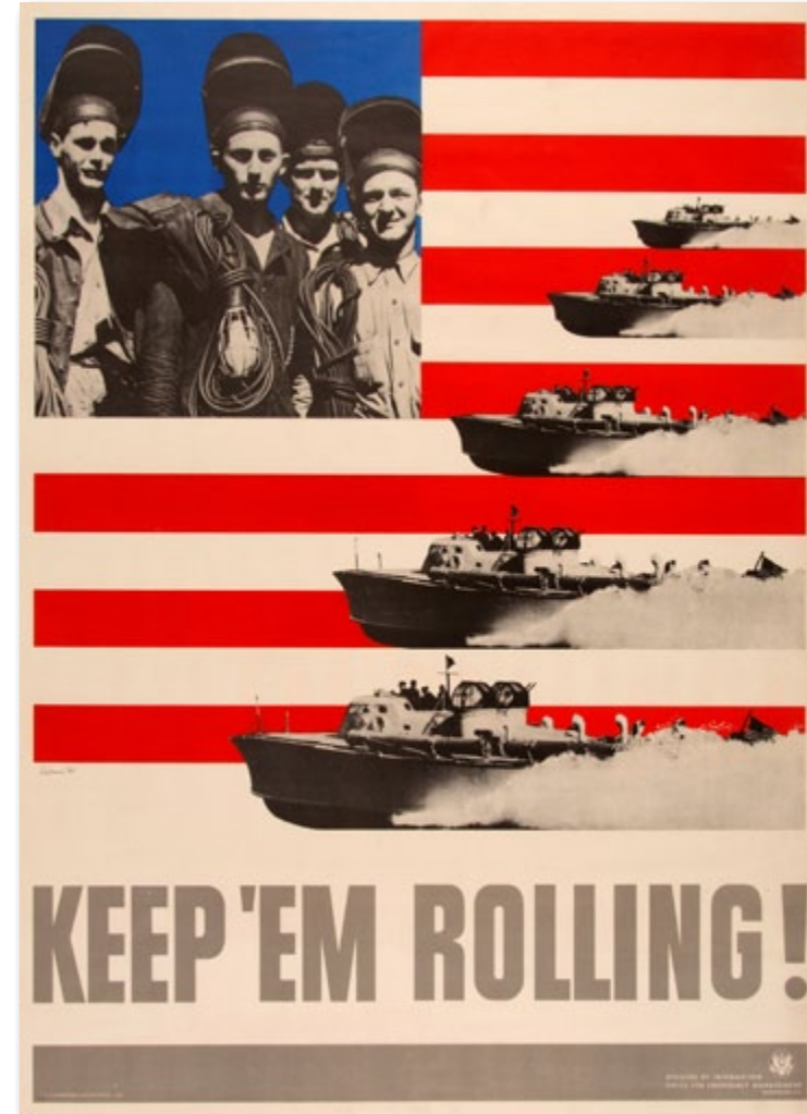
1941 patriotic work incentive poster designed by Leo Lionni and issued by the Office of Emergency Management. This is one of four in the series, the others featuring planes, tanks, and artillery battery.

outside the channel reverberated with the full-throated roar of Truscott's high-powered Navy and Army boats running sea trials. The company's docks were packed with the dull-gray wooden boats, as well as large barges loaded with crash boats ready for shipment.