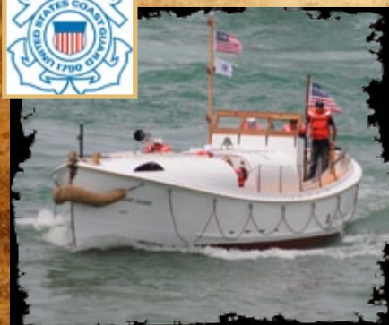
United States Coast Guard MLB 36460