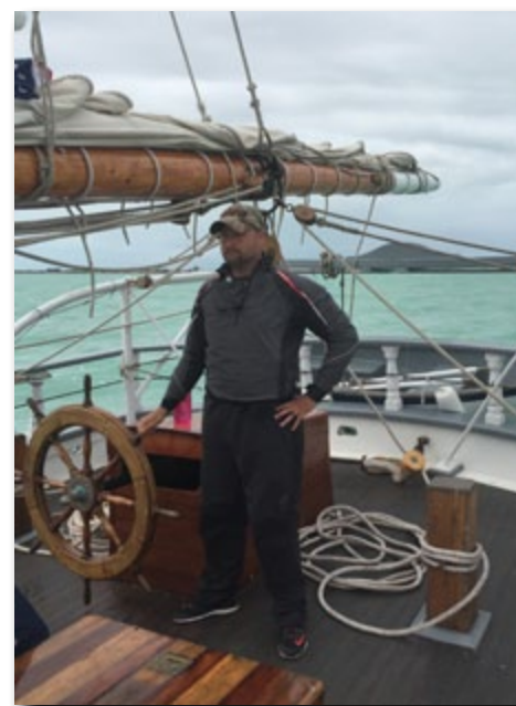
2017 Friends Good Will Captain,