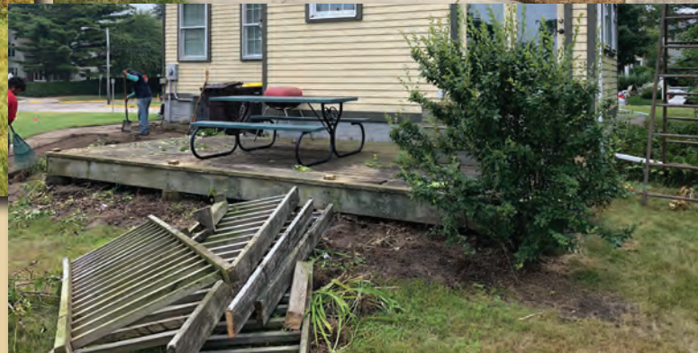
Pictured: DeBest Inc worked hard to clear the overgrowth on the hill overlooking the Black River channel and South Haven pier lights. Trees were trimmed and brush cut back to allow for better views. Cottage Home crews removed the enclosed deck rails and added a step to open up the back porch and increase visibility of the historic home.