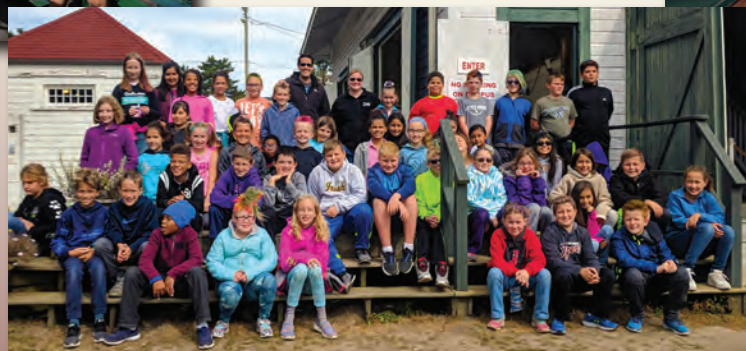
Left: North Shore Elementary brought over 100 5th graders over two days on their annual FGW sail and early Michigan history program this September.