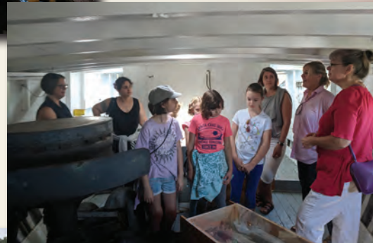
Below: 2018 STEM Camp students enjoy a ride on Lindy Lou at the end of the week-long maritime educational camp.