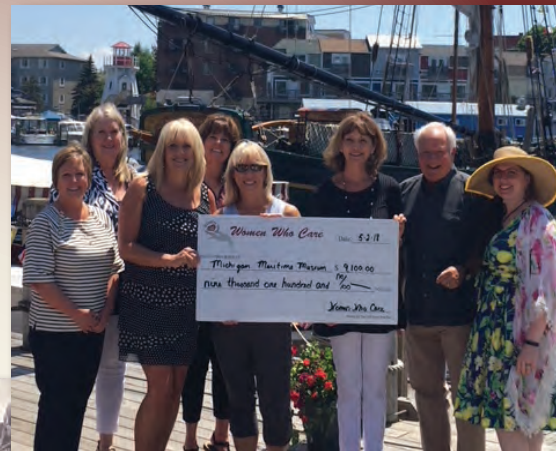
Above: MMM receives nearly $10,000 from the South Haven Women Who Care organization as a matching sponsor for our MAKE Education Happen Grant

The Museum awarded two schools this year with the MAKE Education Happen Grant which, with a 50% matching sponsor, covers the entire cost of their field trip to the Museum. We were also honored this year to be a recipient of a $10,000 award from South Haven's Women Who Care organization. This award will act as the sponsor match for the MAKE Grant program. Together with the Women Who Care, we have the potential to take over 1000 students out on Lake Michigan; an incredible opportunity!