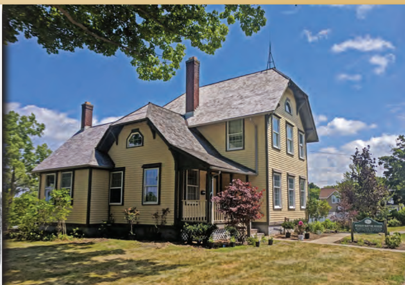
Above: A historic photo circa 1903-1915 of the Keeper's House next to a current photo of the house just after the landscaping project.